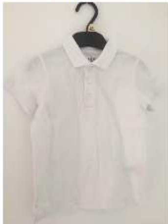
Boys Polo Top Age 3 - 4 years