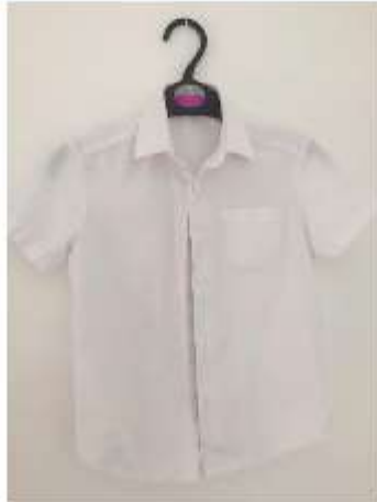
3 x Short Sleeve Shirts Age 3 - 4