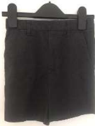
Boys Shorts Grey Age 3 years