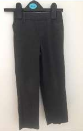
6 x Trousers Age 3 - 4 years