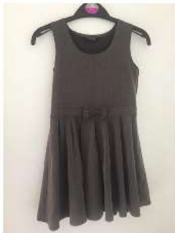
2 x Pinafores Age 3 - 4 years